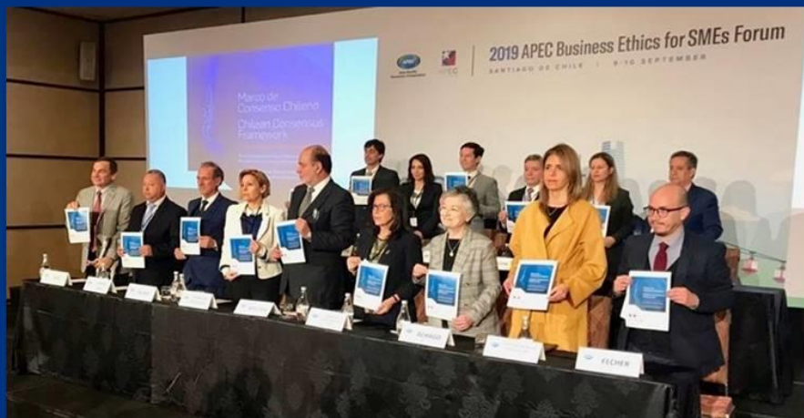
CHILE – 21 PARTIES