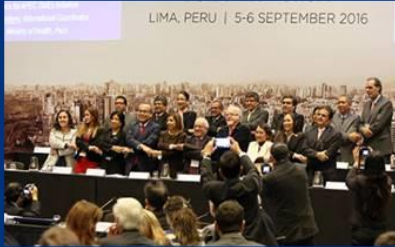
PERU – 22 PARTIES