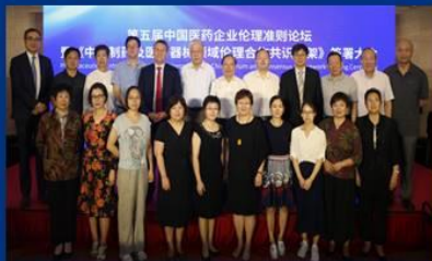
CHINA – 25 PARTIES