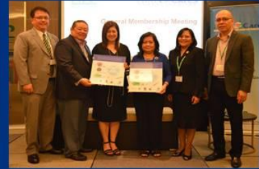
PHILIPPINES – 17 PARTIES