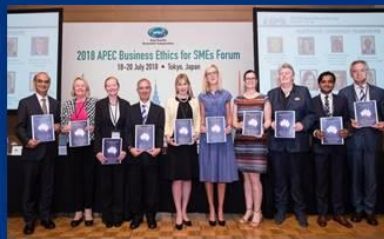
AUSTRALIA – 70+ PARTIES