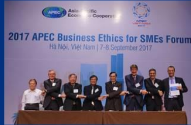
VIET NAM – 9 PARTIES