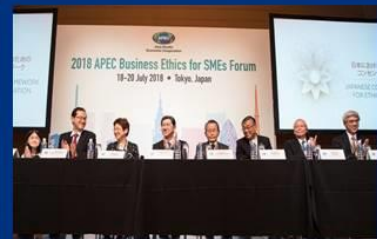
JAPAN – 8 PARTIES